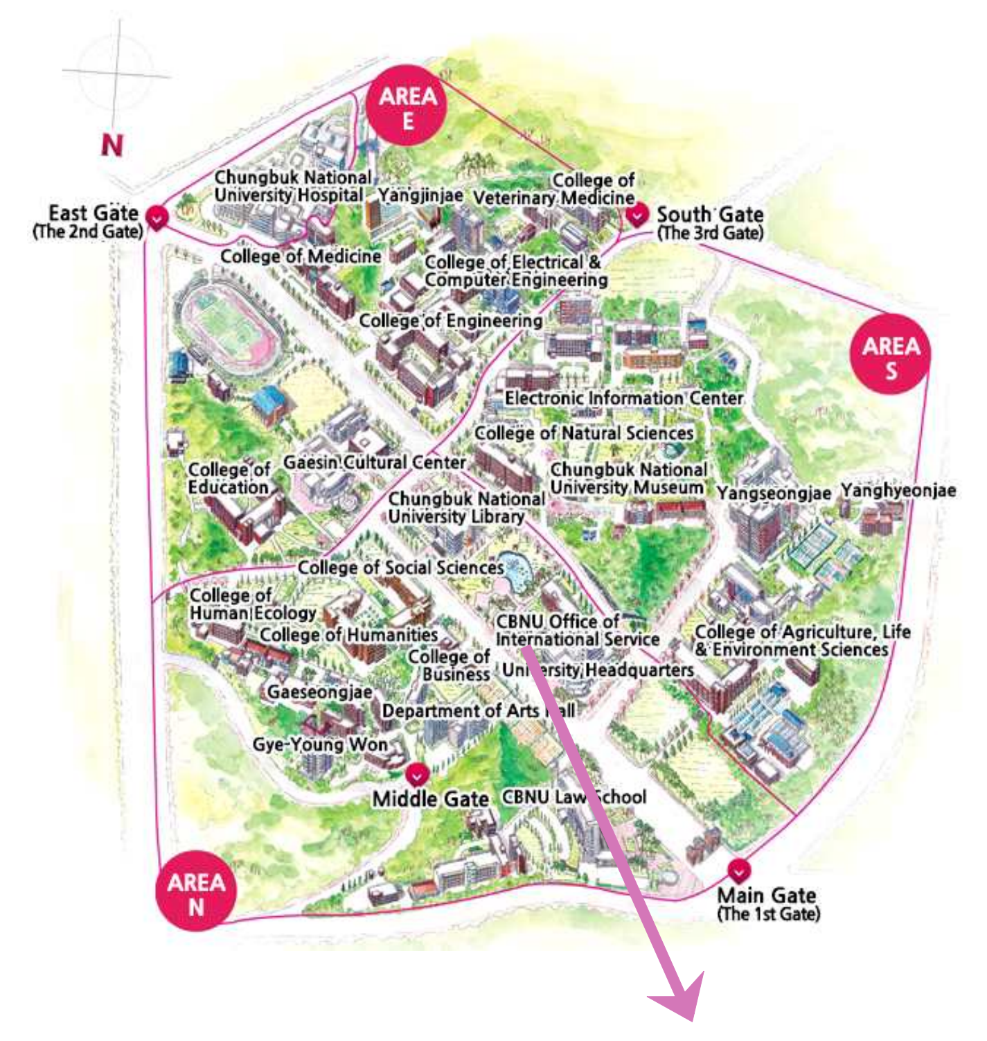
How to get here

국제교류본부(#151, N10) Office of International Services